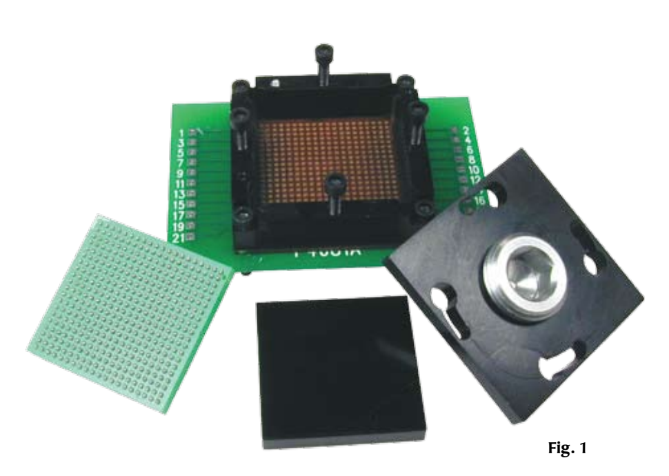
Fastener mount socket with mounting footprint relative to package dimension.

In the prototype and design phase of a new product introduction process it is often important that the prototype configuration closely match the final product configuration, both mechanically as well as electrically. This close matching will have the benefits of shortening the overall development cycle and reducing the potential for future design changes due to unanticipated performance shortfalls. From a socketing system perspective, both the overall size of the socket and the method of attachment become important considerations, often resulting in the need for a socketing system with mounting footprint dimensions minimally larger than the overall BGA package dimensions.